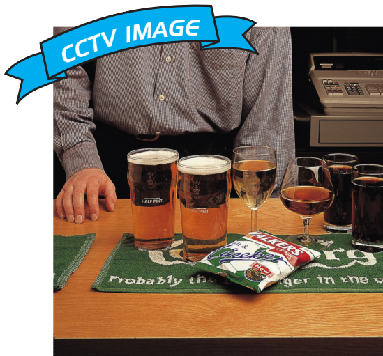
The picture below shows, without a doubt, that not all items passed over the counter were entered into the cash register.

THE VSI-PRO-MAX SAVES YOU MONEY BY KEEPING IT IN THE TILL!